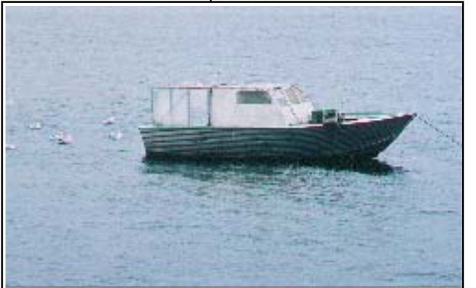
Fishing in front of Topsy Farms

The roofers are looking forward to less windy weather this spring. Eric McGinn says that Amherst Roofing has had a very good winter with lots of work when weather permitted. Projects included the Casino in Gananoque and construction at Queen's. Reg Hitchins of Covertite reported that things were a bit slow for them over the winter but they will be busy enough when the weather improves. The Ontario SuperBuild program is encouraging a lot of new construction projects so the Island roofers should be busy for quite a while to come.