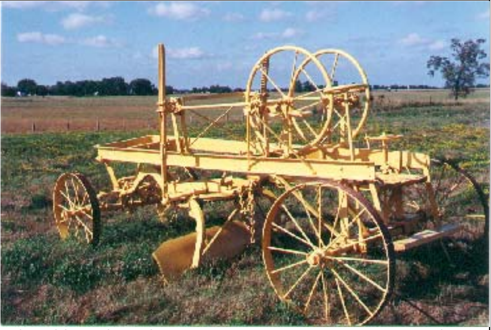
The Old Road Grader

The Amherst Island Men's Society (AIMS) held its monthly breakfast meeting March 9 at St. Paul's United Church Hall. For the first time, breakfast was