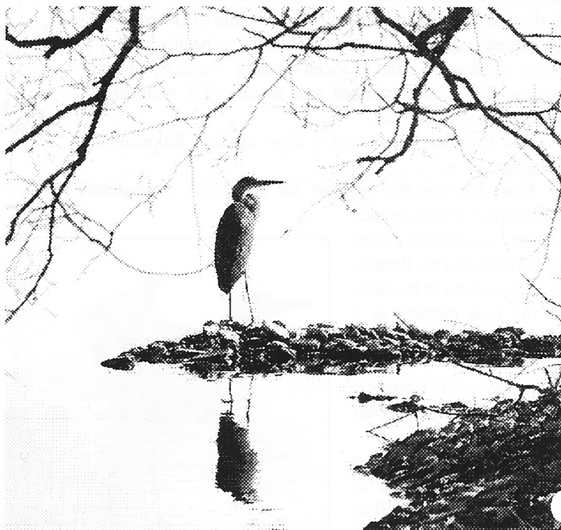
And some Herons...