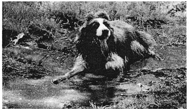
Happiness is... a puddle to cool off in after a sheep drive.