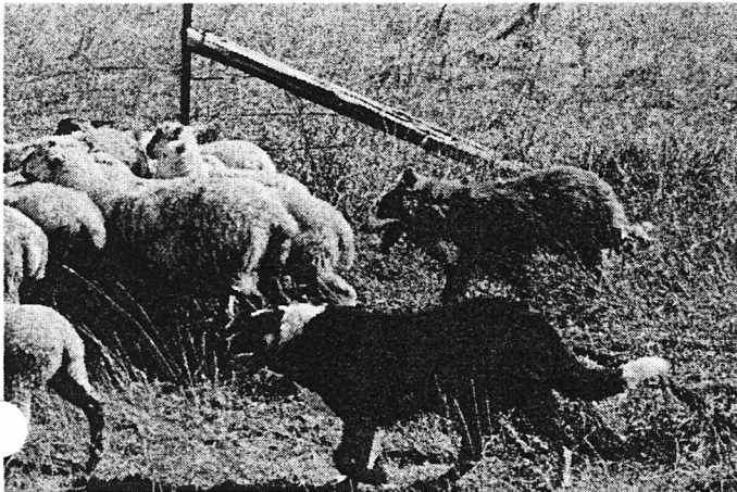
Ed and Sam more or less in control and under control.

If you are interested in rugby sites, two come to mind: www.rugbyrugby.com/ and www.sportsillustrated.cnn.com/rugby/index.html .