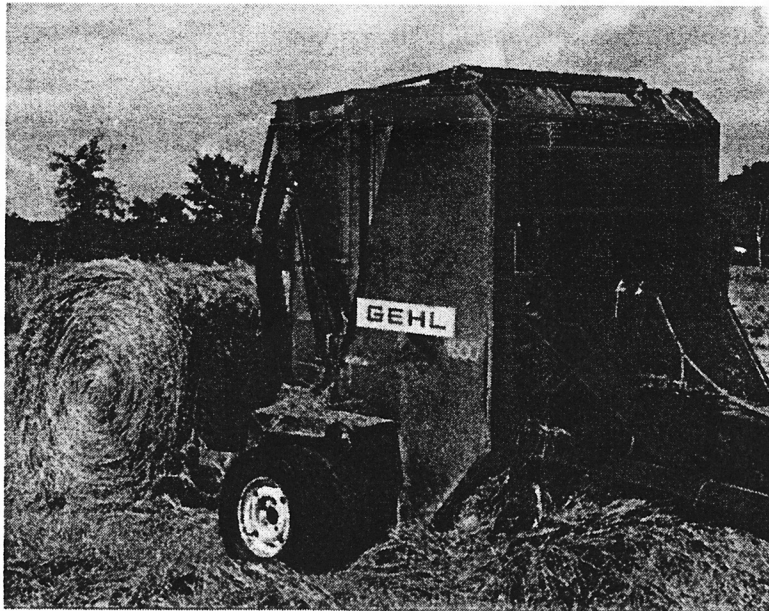
Duals help keep the baler a baler rather than a two bottom plow.

Oh! I almost forgot... Topsy Farms' web site is now up and running. The