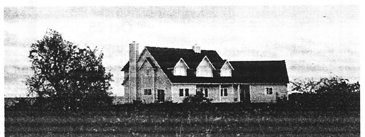
One of the many new houses built this year...