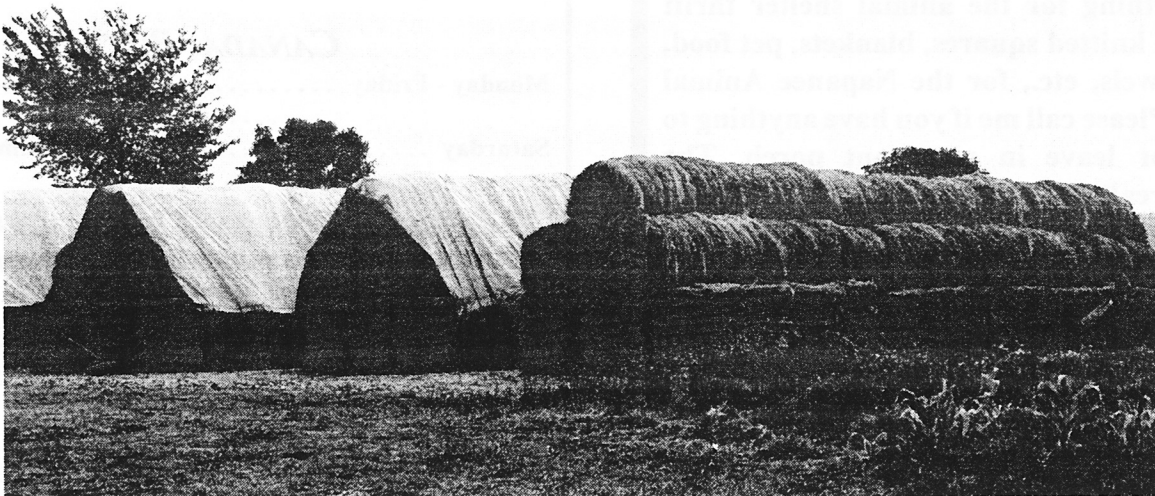
Almost ready for winter...

P.P.S. Pshaw... we all have our hobbies.