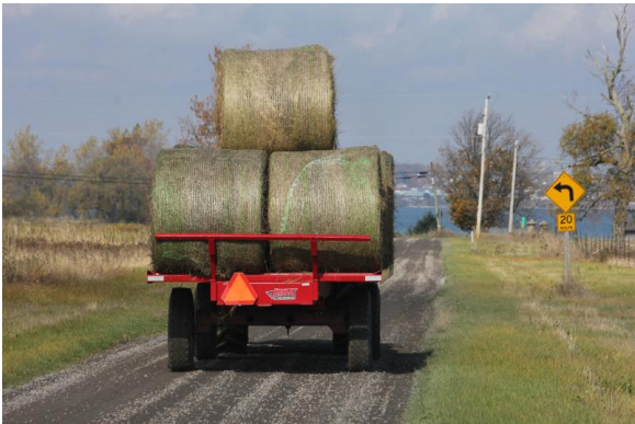
Taking in the hay.