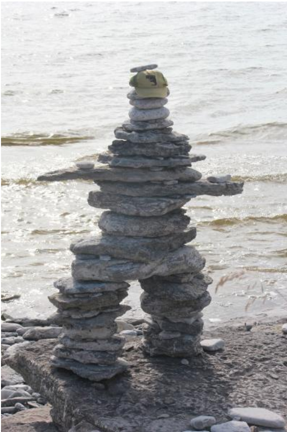
A new Inukshuk family has moved into the south shore near the Community Pasture.