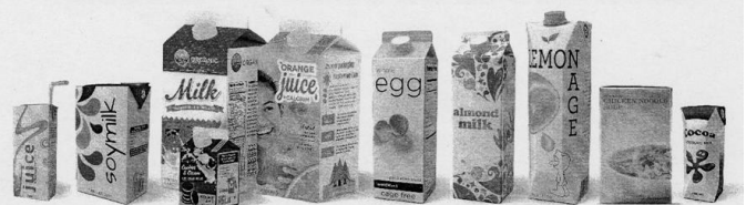
Cartons – juice, milk, soup and others Cartons – jus de fruits, lait, soupes et autres

ALL CARTONS ARE RECYCLABLE. TOUS LES CARTONS SONT RECYCLABLES.