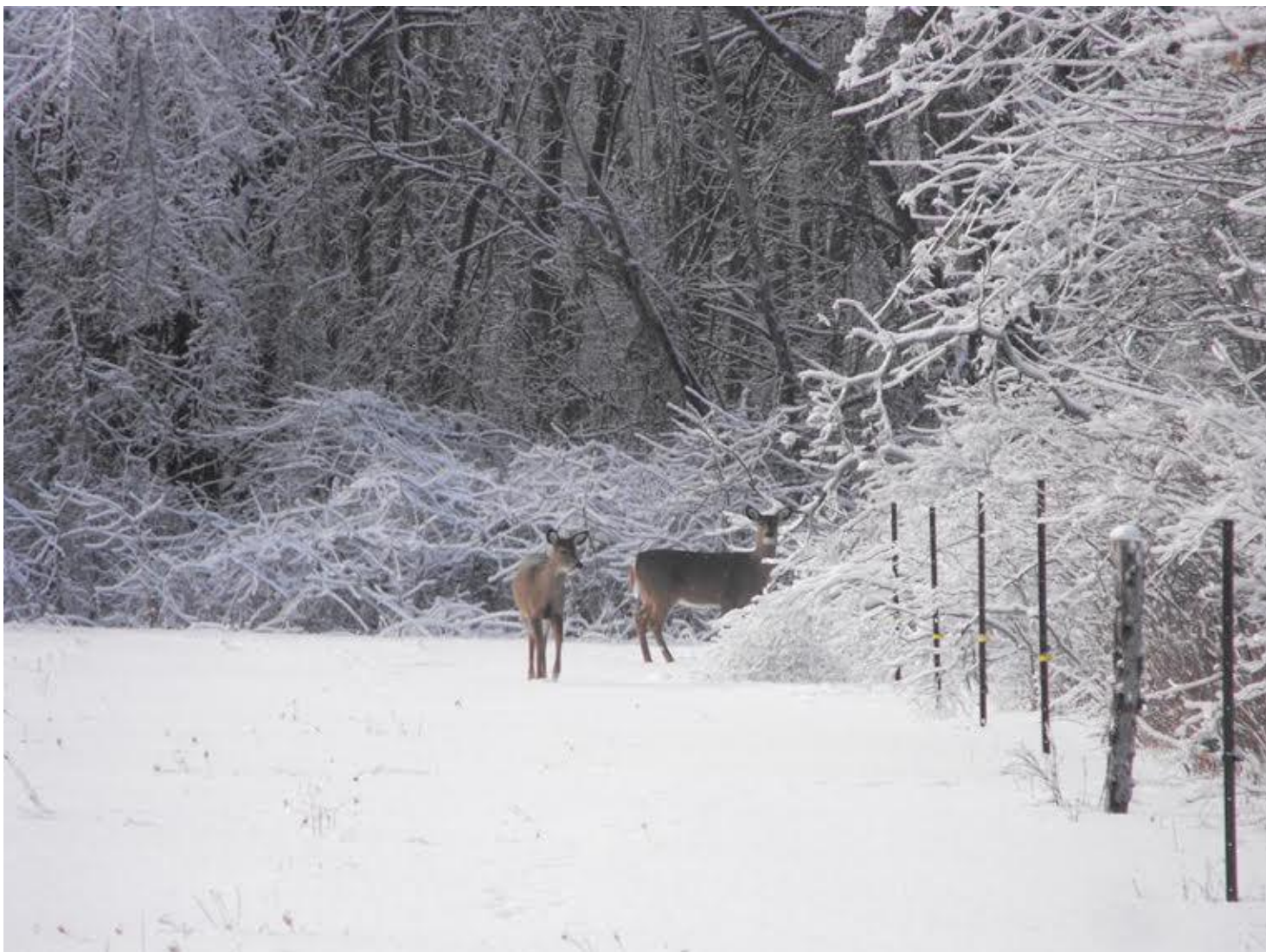
Deer in the Snow