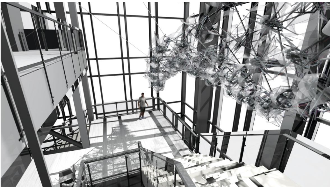
This is an interior rendering of the thesis project, which depicts in detail from an installation of his proposed design.