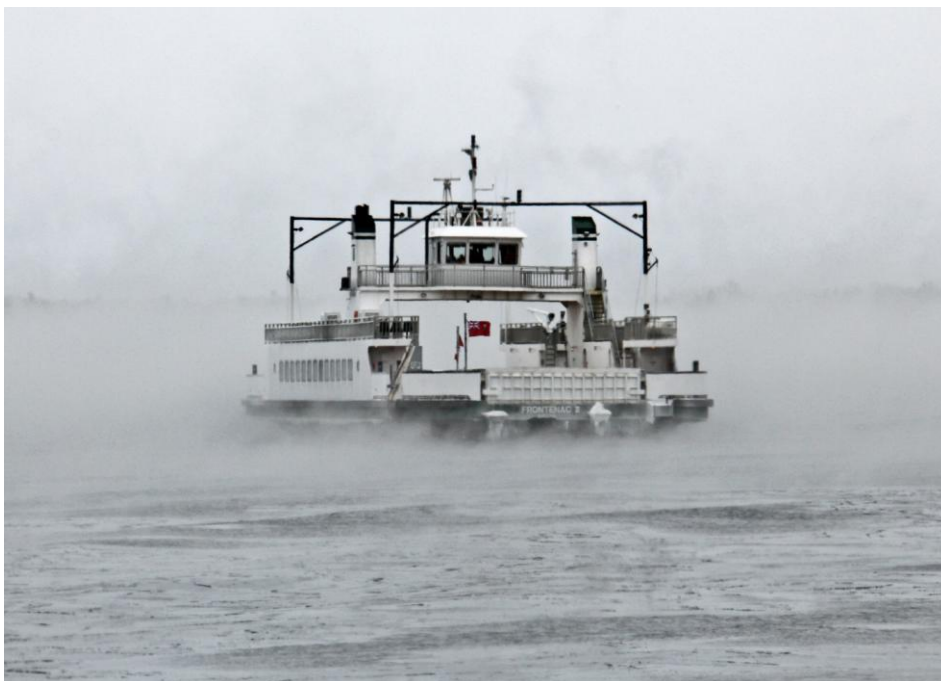
Ferry in Mist