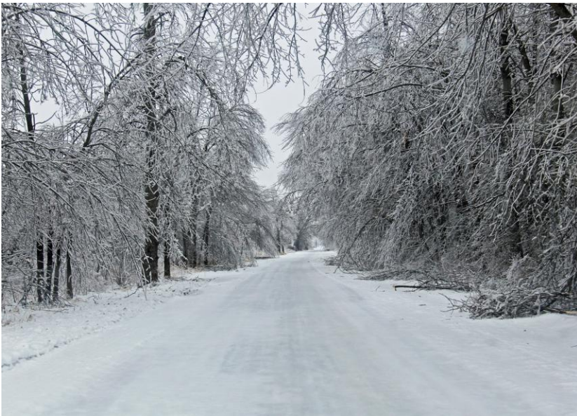
Ice storm on the Second Concession. Photo taken by Brian Little