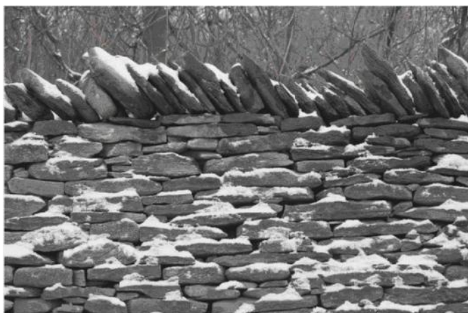
Amherst Island Stone Fence by Andrea Cross

Upon seeing the images I suddenly felt there was a connection between the style of wall that we were building and another style of wall thousands of miles away across the Atlantic ocean on Amherst Island in Lake Ontario, Canada.