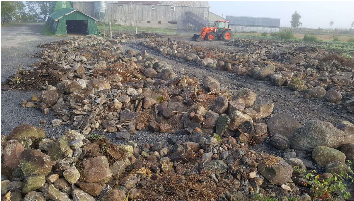
Preparation Work – 12 Tones of Rock by Sally Bowen