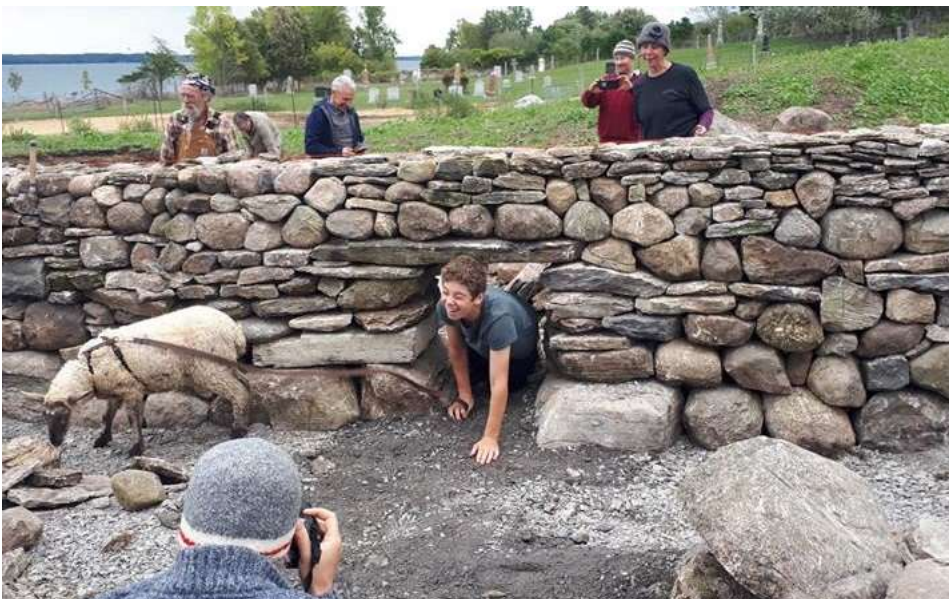
Above Dry Stone Wall Three