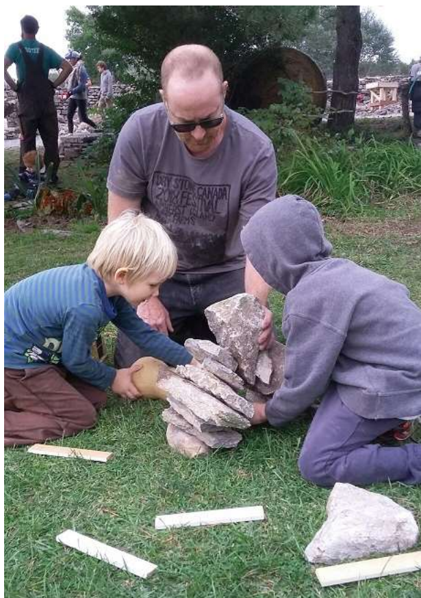
Younger wallers learning the craft.