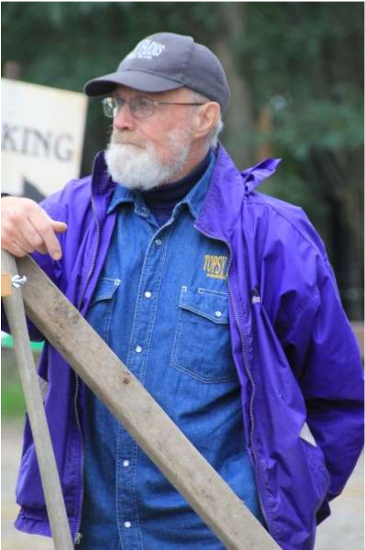
Faces of Amherst Island