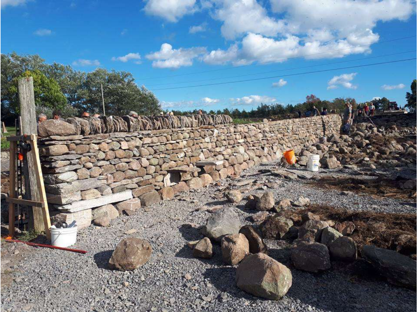
Dry Stone Wall Six

Issue 463 There's always another boat. NOVEMBER 2018