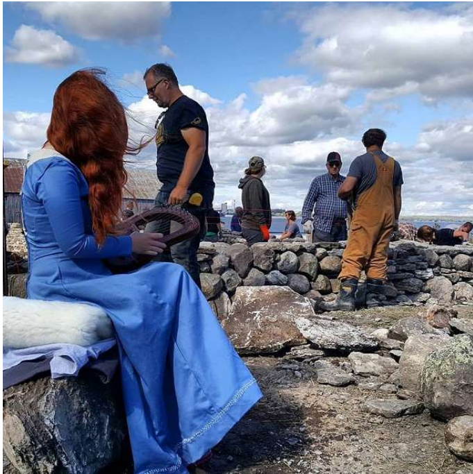
Lauraellen camp to play the harp.

Our Dry Stone Canada Festival built 120 feet of rock wall, bordering our laneway and barnyard, at the end of September.