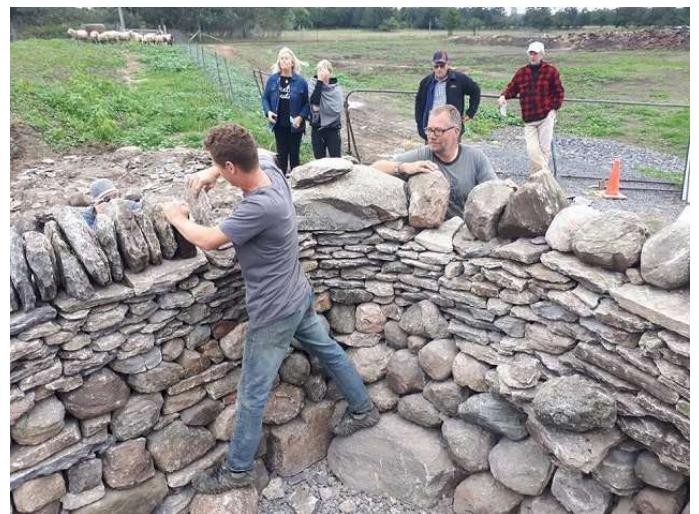
Dry Stone Wall Seven

When you come to the farm, take a look at the details of the stones outlining the magnificent bench and its backing. Check out the interplay between round and flat stones. Admire the artistry in the curve of the wall.