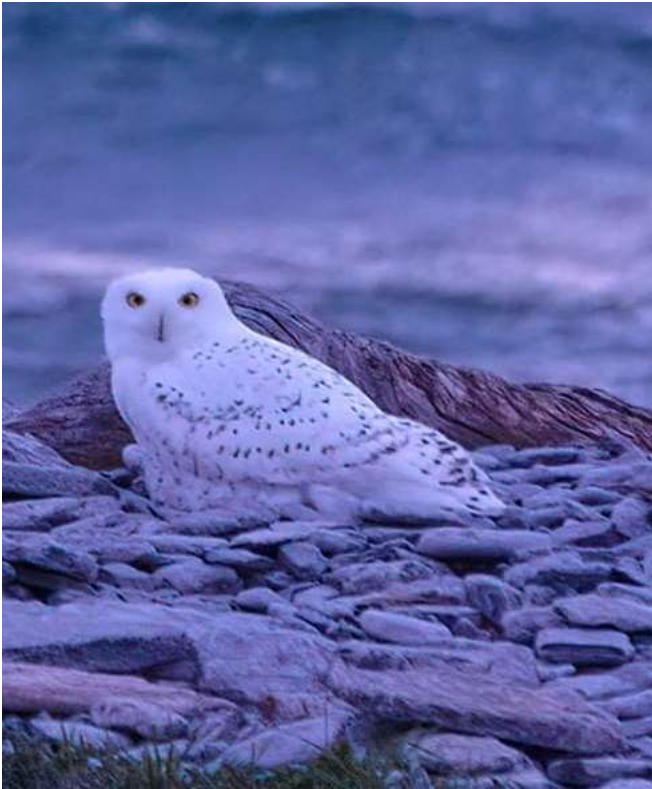
Our first Snowy this season