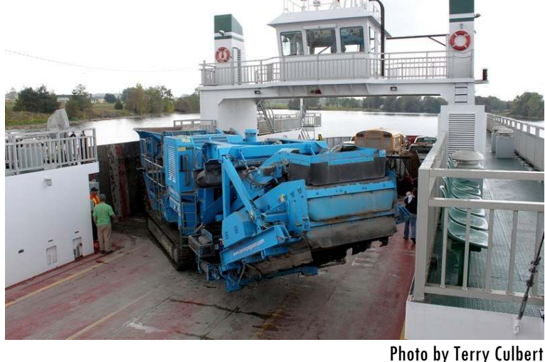
On September 29<sup>th</sup>, a 42-tonne gravel crusher made in Ireland leaves the Caughey Pit on Amherst Island after a 2-month work project.

"The surprise is the eastern Dakotas and western MN. This area seems to be the source of a large number of the Monarchs moving through the lower mid-west at this time. Nevertheless, the overall numbers are down. But, it gets worse. The migration is just beginning to navigate 1000 miles of hell - a nearly flowerless/nectarless and waterless expanse of