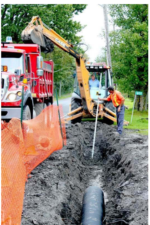
The Loyalist Township Roads Department of Amherst Island installed new 15-inch plastic culverts along a section of the Front Road in the Village of Stella.

The Greater Yellowlegs is about 14 inches or 36 centimetres in size. The back is dark brown and mottled. The bird is heavily streaked on the throat and breast and its belly and sides are spotted. Both the Greater at 14 inches and its finer cousin the Lesser Yellowlegs at 10 ½ inches have bright yellow to orange legs. We get both species here but the difference in size is not always easily seen. The Lesser has a higher, shorter call and appears to have a finer and more delicate beak. On August 6th in 1983, Marnie Matthews recorded 50 Lesser Yellowlegs that had been grounded on Amherst, by rain, but by