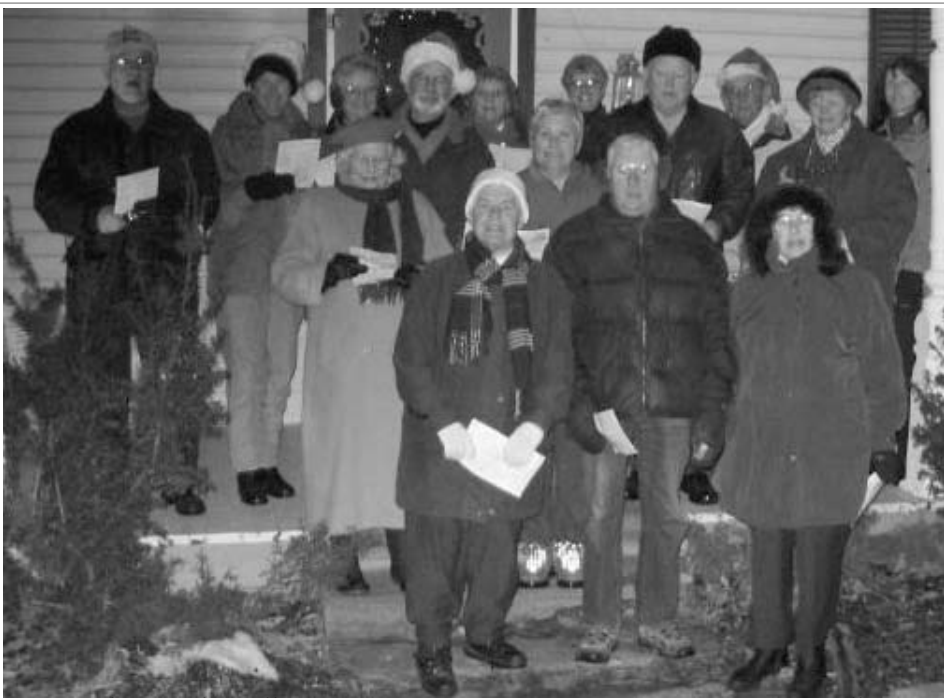
Carrolers in the Village