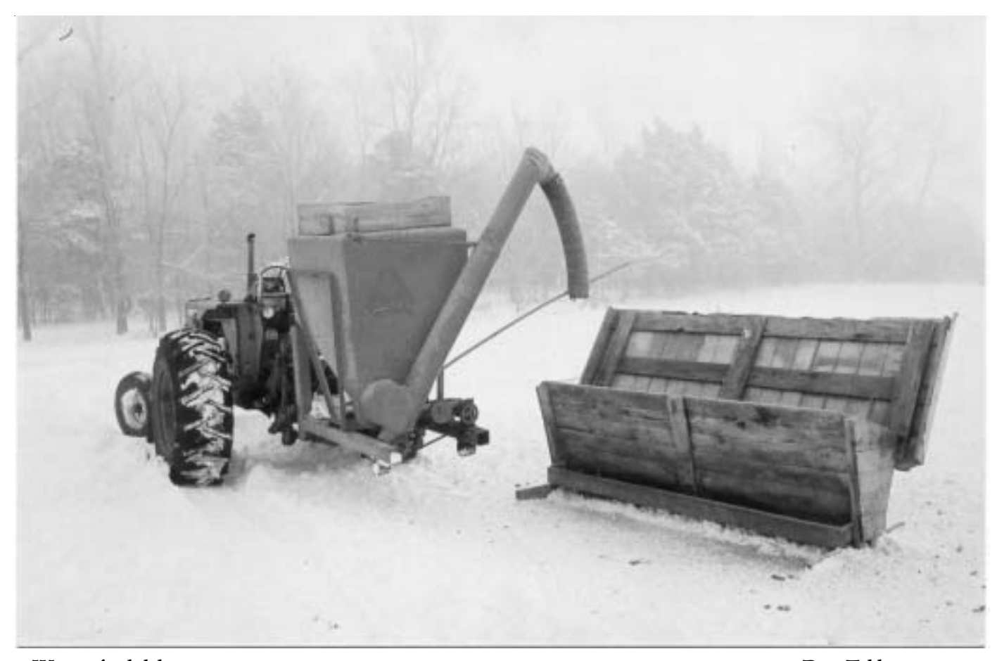
Winter feed delivery Don Tubb

sure I look at them in the right perspective!"