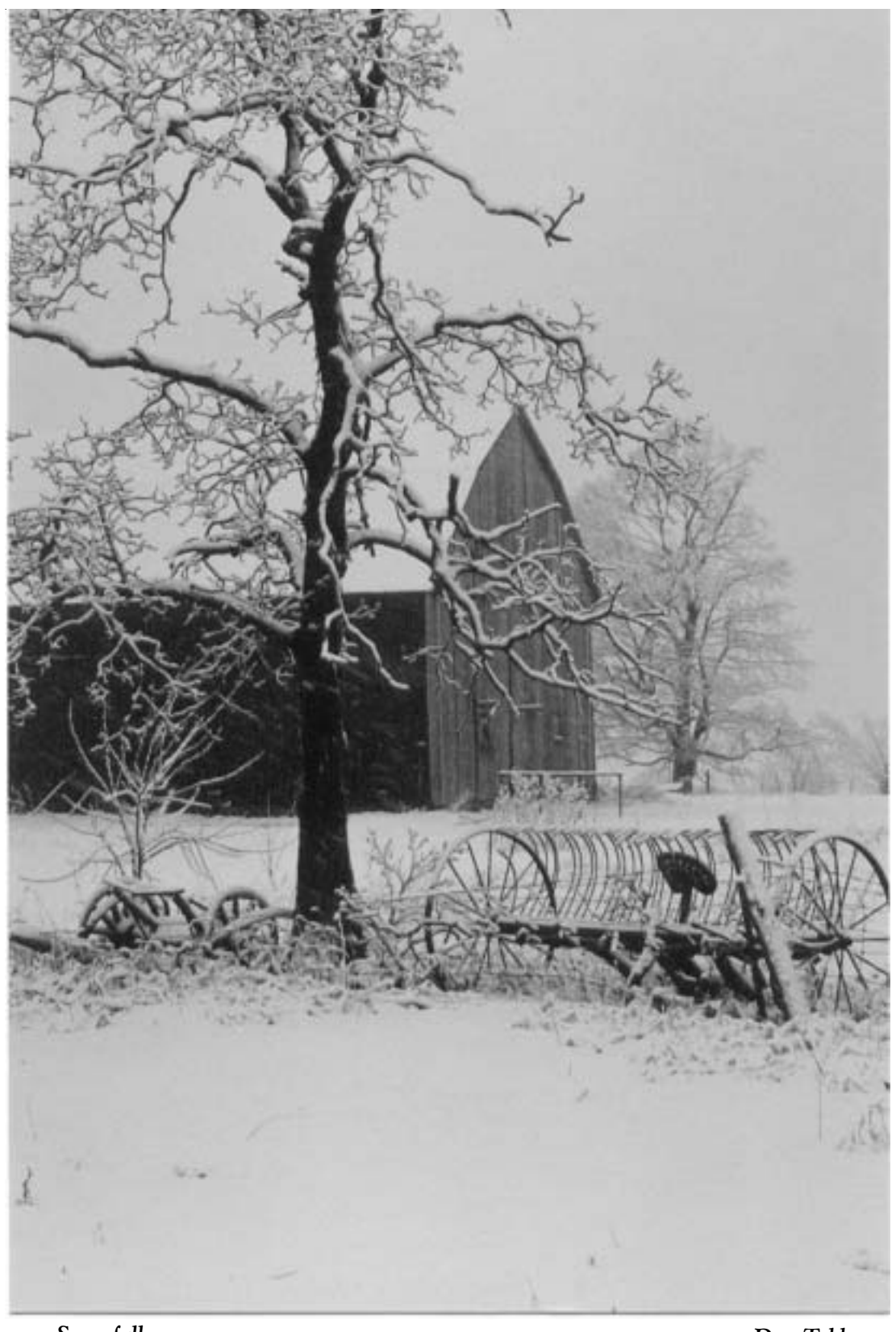
Snowfall Don Tubb