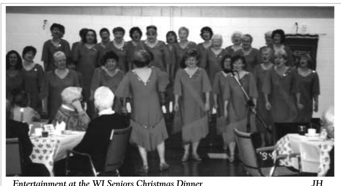
Entertainment at the WI Seniors Christmas Dinner

vided at that time as those donations will be used locally and some volunteer credit will go to the W.I.