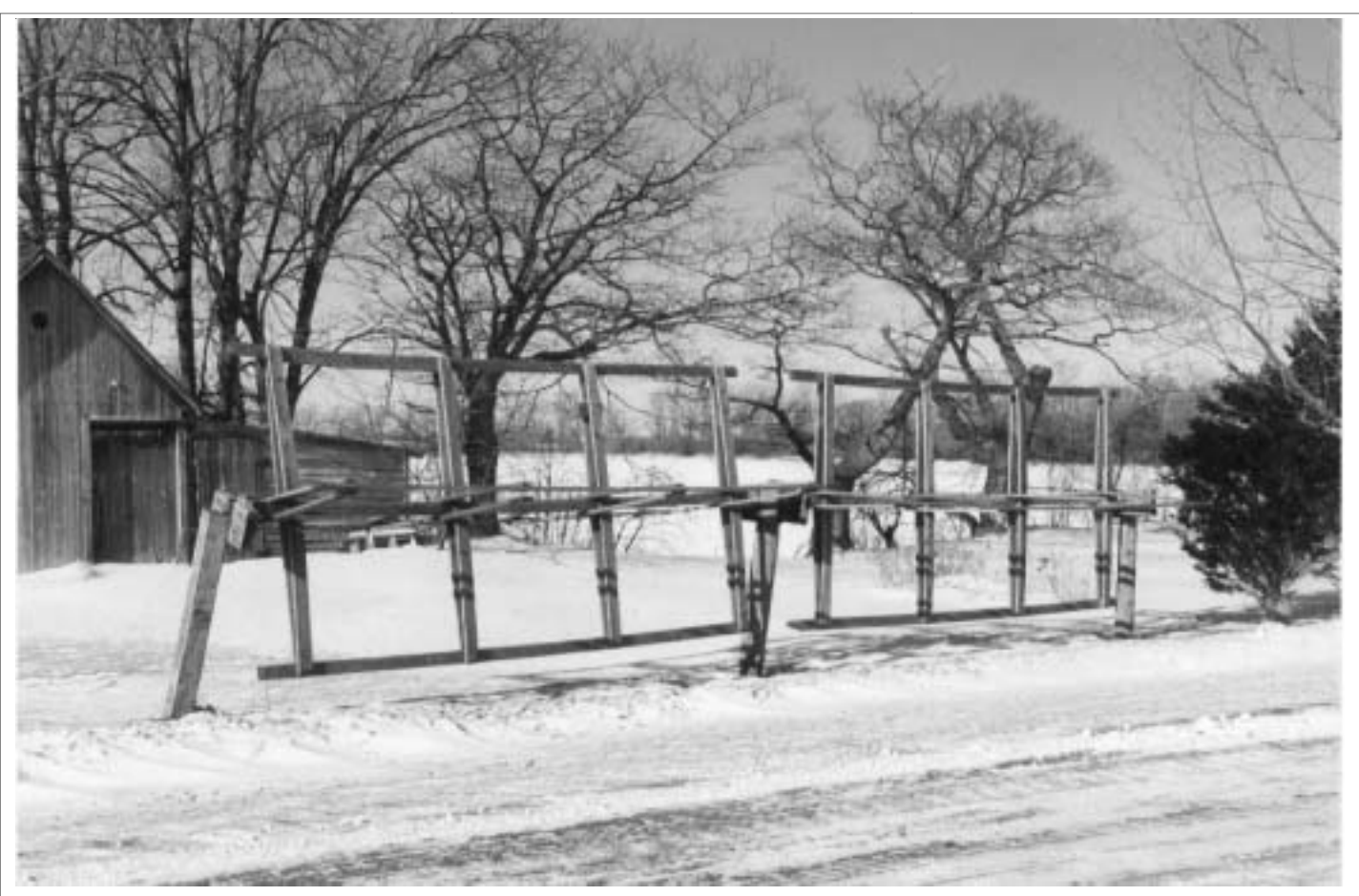
The Fishing Village in winter